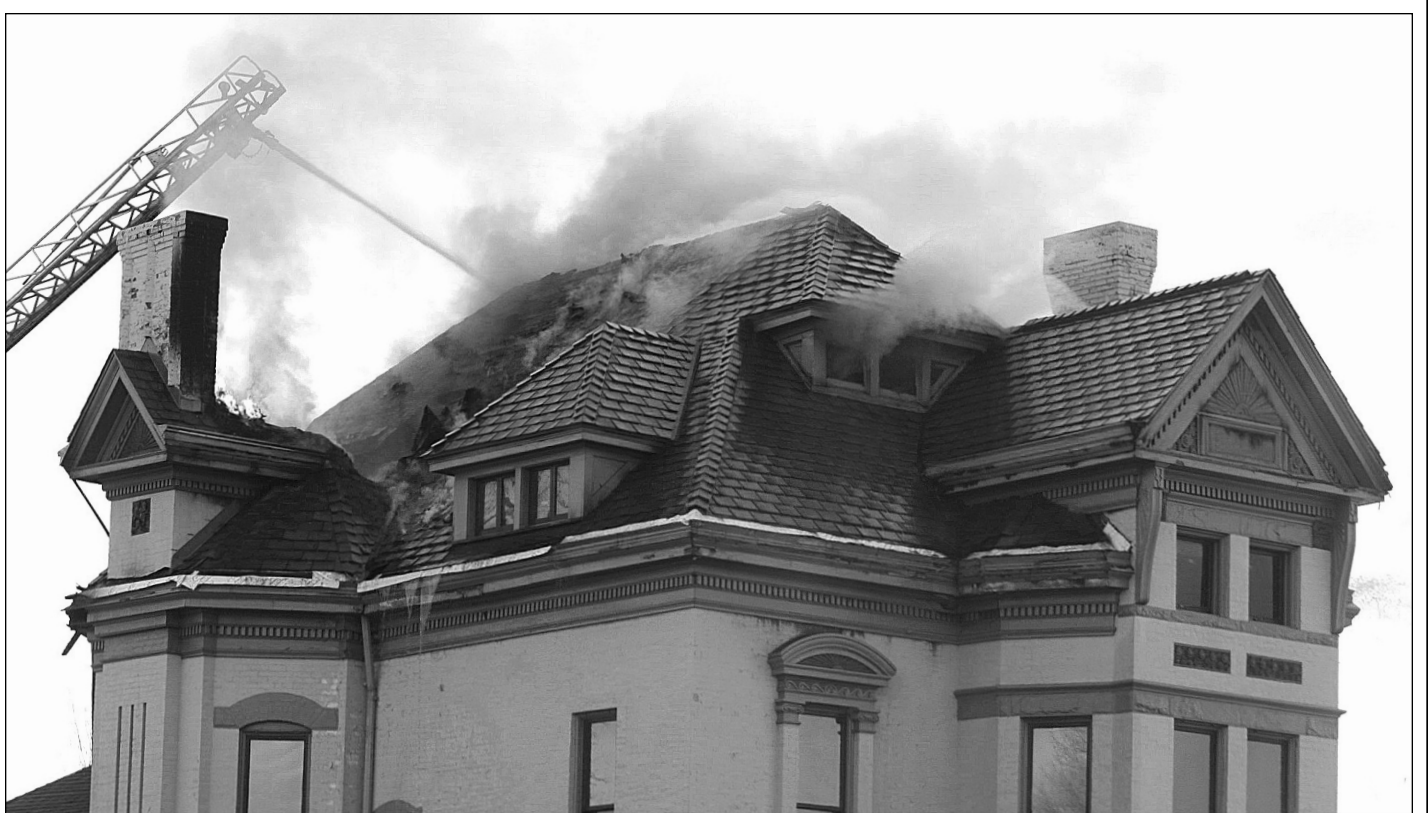
Photo of the Month: Whaley House Nov. 30 (see related story p. 10)